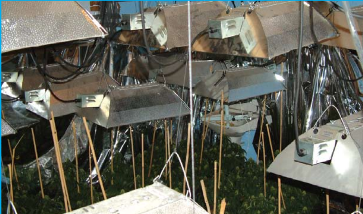
Cannabis cultivators use extensive high powered lights to speed up cultivation

These look like domestic 'Tumble Drier' outlet tubes, but are usually larger and silver coloured. They are used to either take the hot air out of the property, or bring fresh air in. They may be seen protruding out of a window.