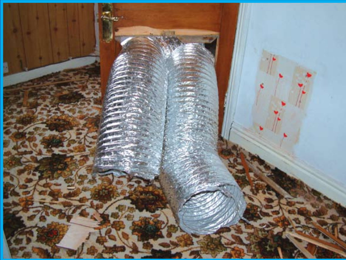
Cannabis cultivation needs a hot, humid environment, which can lead to fires

These signs may include people exchanging small packets for cash, people using drugs while sitting in their cars, and syringes or other paraphernalia left in common areas or on neighbouring property.