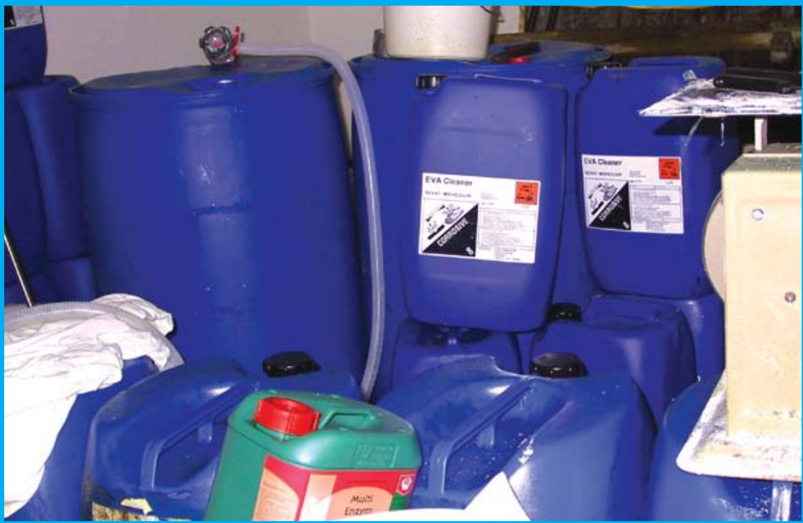
Large quantity of unusual chemical containers should be treated with suspicion