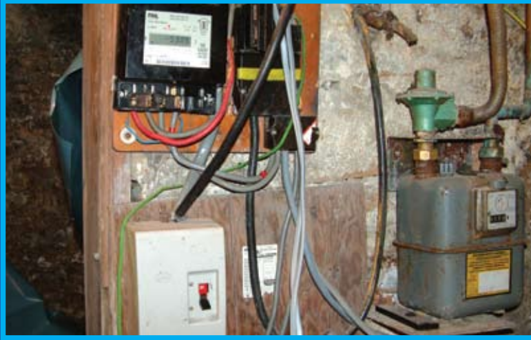
Cannabis cultivators can cause fires in properties by tampering with wiring